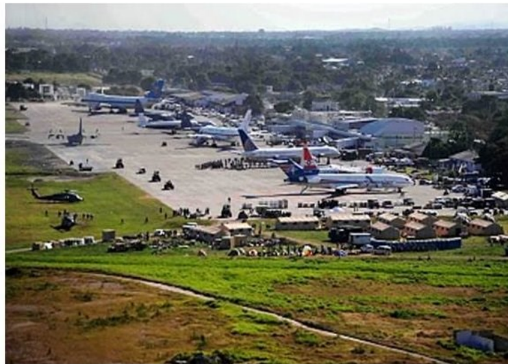
Figure 2. Port-au-Prince International Airport about one week after 2010 earthquake

Of course, often a disaster can strike a region without damaging the airport, resulting in extreme operational demands on the airport with incoming aid flights, outgoing evacuation flights, search and rescue operations, and economic and social recovery. For example, operations at the airport