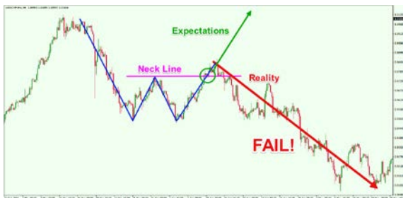
Fig. 3. Double Bottom didn't follow in pattern. Source: https://forextraininggroup.com/learn-trade-profit-chart-pattern-failures/

In conclusion, the problem with the technical analysis is that it does not consider other exogenous factors that can change the trend of the stock markets. For example, in September 2019, the IBEX35 (Spain) was bull market. Technical analysis indicated that the upward trend would continue. The World Trade Organization (WTO) ruled that the European aeronautical company Airbus had illegally received aid from European countries [13]. The President of the United States announced taxes for products from the European countries. The main stock market indexes of these European countries collapsed, breaking the bull market.