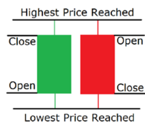
Fig. 1. Types of Japanese candlesticks.

To represent the price of a stock, you use charts called Japanese candlestick charts. The Japanese candlestick gives information about the opening, closing, high and low price that the security has obtained during the session (Fig.1). There are two types of candlestick: when a value closes positive with respect to the opening, the body of the candle is green or white. When a value closes negative with respect to the opening, the body of the candle is red or black.