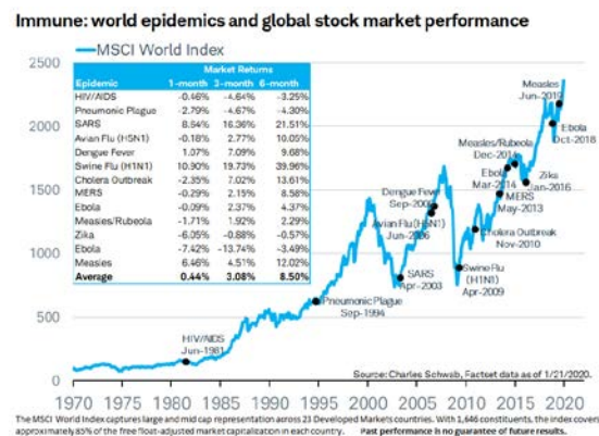
Fig. 4. World epidemics and global stock market performance. Source:

Since 1980 there have been many epidemics and pandemics that have affected the world. The most important epidemics and pandemics in the last 30 years have been the ones shown in Fig.4.