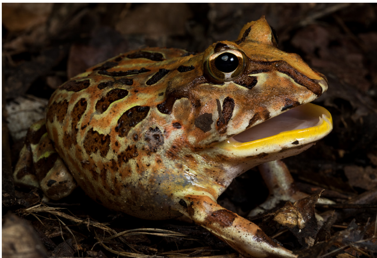
Figure 3. Juvenile specimen of Ceratophrys joazeirensis (UFMG 19076) in life, showing color pattern characteristic of this species and the odontoids on either side of the mandibular symphysis, characteristic of the genus.