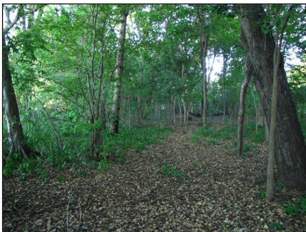
Figure 2. Narrow forest fragment between the margins of Verde Grande river (to the left) and an unpaved road (to the right), where the specimen of Ceratophrys joazeirensis (UFMG 19076) was captured.

The collected specimen is a juvenile whose external morphology fits well in the diagnosis of Ceratophrys joazeirensis , such as a triangular, medium developed eyelid appendix and the dorsal color pattern with three dorsolateral blotches on each side, resembling a trident (Mercadal, 1986) (Fig. 3). Two weeks after the collection, HCC visited the site but the weather was dry. The ponds have dried up and no horned-frog was heard or spotted, reinforcing the explosive breeding behavior of this elusive species.