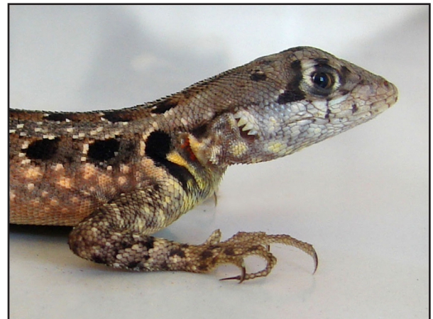
Figure 1. Tropidurus cocorobensis (LPE 1949), municipality of Floresta, state of Pernambuco, Brazil.

Comments. — Tropiduridae is a reptilian family with a large number of known species among the neotropical lizards (Torres-Carvajal, 2004). The genus Tropidurus occurs from southern Venezuela east through the Guianas to northeastern Brazil, from there west south of the Amazon region to eastern Bolivia, extreme northern Uruguay, and central Argentina (Frost et al. , 2001). In Brazil, there are 36 species of tropidurids, 18 of which belong to the genus Tropidurus (Bérnils and Costa, 2011). Currently, this genus is subdivided into four species groups: T. spinulosus , T. torquatus , T. bogerti , and T. semitaeniatus (Frost et al. , 2001). The Tropidurus torquatus group was revised by Rodrigues (1987), whose complex of species was well-defined through the geographical distribution and morphology based on the mite pockets and skin folds in the three major areas of the body (neck, axillary, and inguinal regions). Among the Tropidurus of the torquatus group, T. cocorobensis Rodrigues, 1987 (Fig. 1) is a psammophilous lizard, endemic from the Brazilian Caatinga. It was described from the municipality of