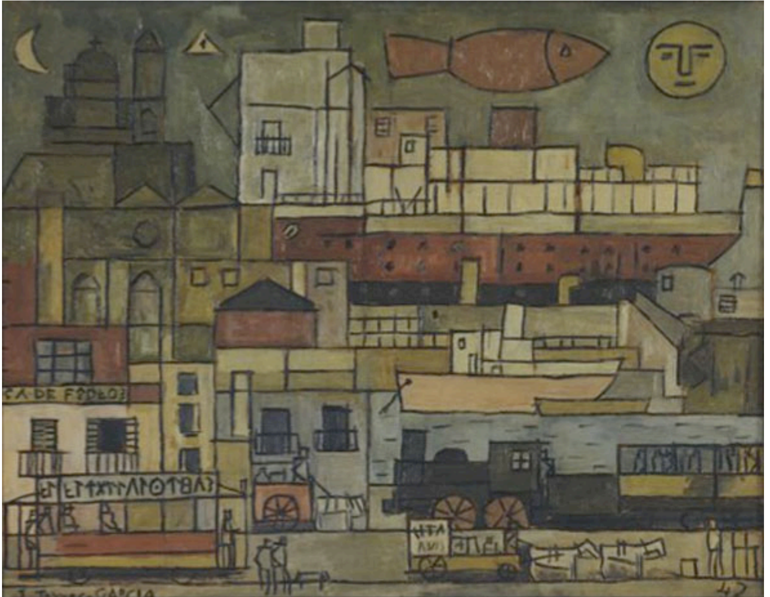
Joaquín Torres García El puerto, 1942, óleo sobre cartón, Museum of Modern Art, New York