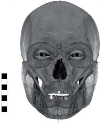
Fig. 2. E1807 Approximate anatomical build-up.

bony attachments, with these attachment points having been approximated in reference to the skull itself. The warp mode was introduced in Adobe Photoshop CS2, and involves being able to apply a mesh over an image, or part of an image, and alter the dimensions either using handle manipulations along the mesh gridlines (similar to the handles used in vector graphics), or in a specific area of the image located within the mesh.