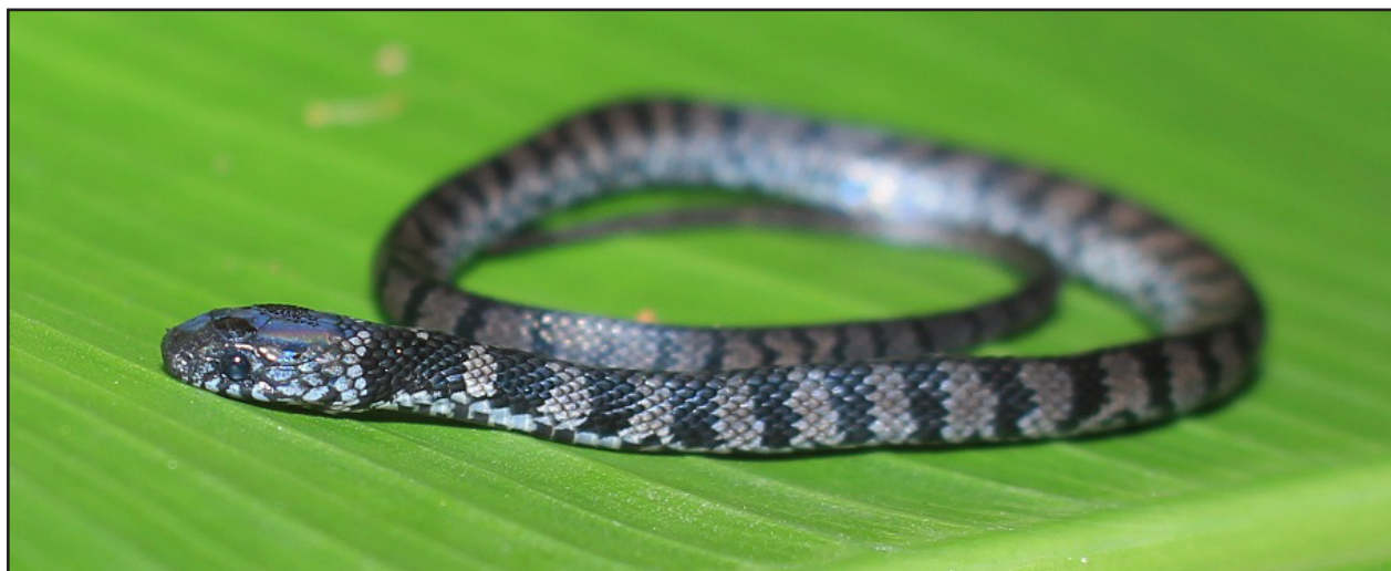
Figure 2. Subadult female Ninia pavimentata (UVS-V 01181), from the Baracoa, Sierra de Omoa, department's Cortés, Honduras.

collection of the Museo de Historia Natural of the Universidad Nacional Autónoma de Honduras in the Valle de Sula (UVS-V).